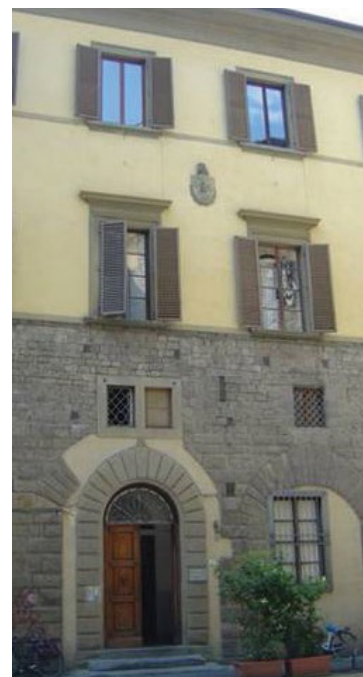
13th century palazzo in the Santa Croce district – AIFS Global Education Center in Florence, Italy