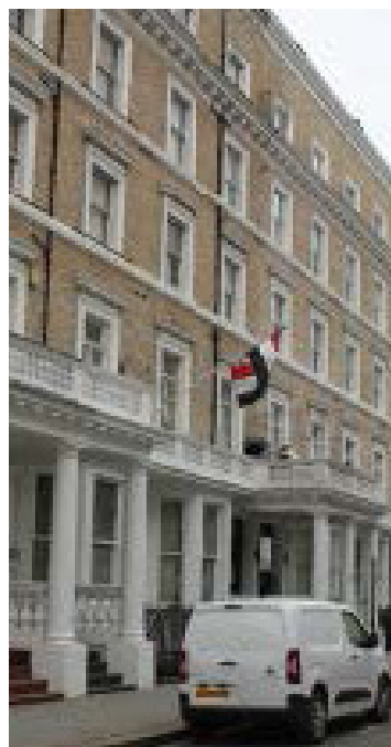
Taylor House – AIFS Global Education Center in London, England.