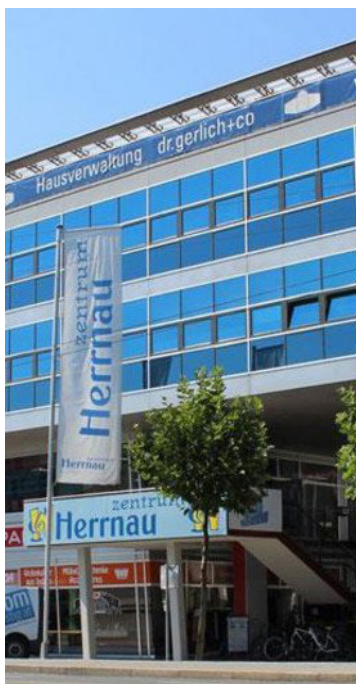
Zentrum Herrnaue – AIFS Global Education Center in Salzburg, Austria.